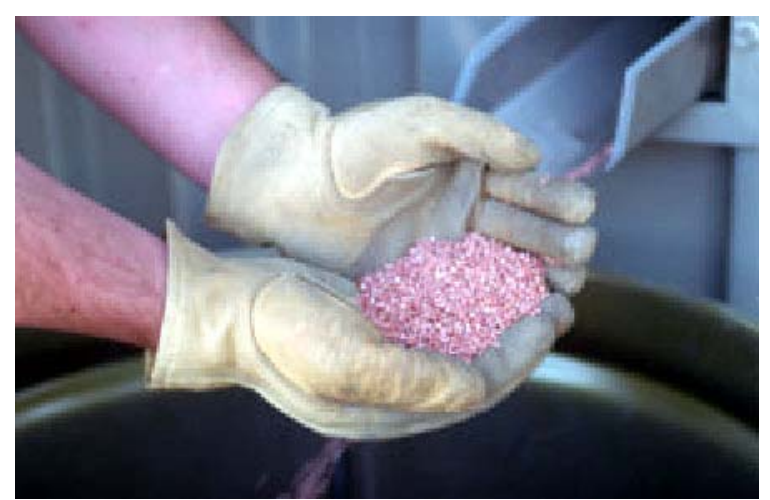
Fig. 4. Clean copper ready for reuse.