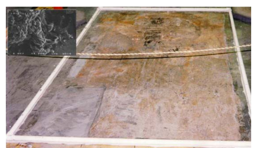
Fig. 3. Loosened surface material on concrete. Inset: Microscopic image of degraded surface material.

Biodegradation of Concrete is a technology developed by British Nuclear Fuels, PLC (BNFL) and the Idaho National Engineering and Environmental Laboratory (INEEL) that utilizes this naturally occurring phenomenon for removing surface material of radionuclide contaminated concrete. The technology can be described in three stages: application of microbes and nutrients; maintenance of microbial activity; and removal and packaging of surface material for waste disposal. The process is a passive one that essentially leaves the bacteria to actively degrade the cement matrix until the concrete surface material is loosened for easy removal to a desired depth. Figure 3 shows loosened surface material on concrete.