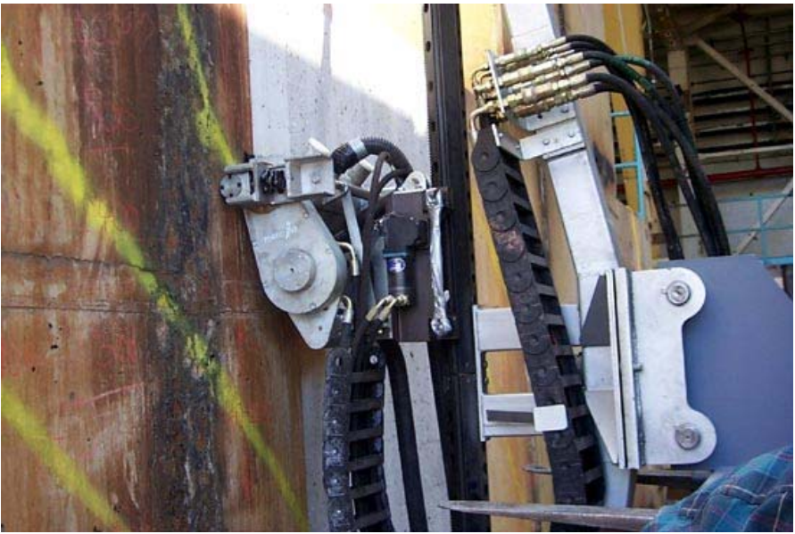
Fig. 1. Concrete shaver decontaminating wall surface.

The Marcrist Industries Limited concrete shaver is a self-propelled, electric-powered, concrete diamond-shaving machine that can remove concrete surfaces with extremely accurate tolerances. This unit has a 25-centimeter-wide shaving drum that is suitable for flat or slightly curved floors and a vacuum port for dust extraction. For decontamination and decommissioning (D&D) projects, the shaver can be used for decontamination of large areas or hot spots on floors. The unit weight is 150 kilograms, and the cutting depth may vary from 0 to 1.3 centimeters. The shaver can operate within 7.5 centimeters from a wall/floor interface or other obstruction (3). Figure 1 shows the concrete shaver in use to decontaminate a wall.